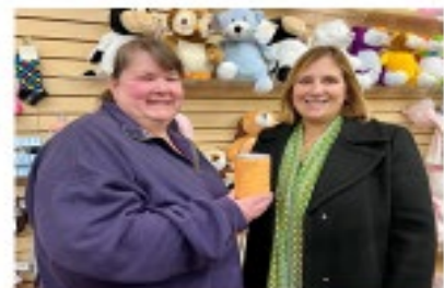
November CCC Can Drive