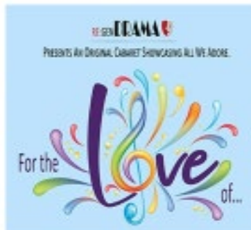
ReGen Drama Theatre