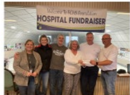
Glencoe Curling Bonspiel