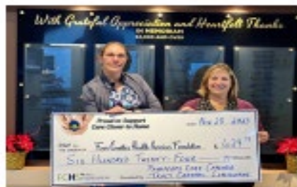
Pampered Chef Party