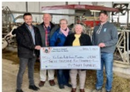
Dairy Cares Gala