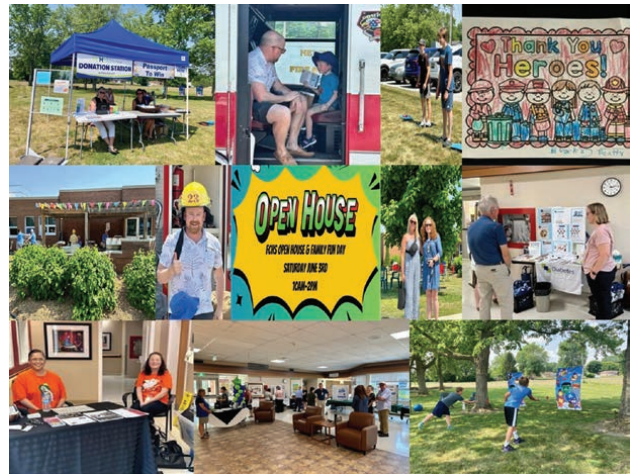
FCFS Open House, June 3, 2023

This autumn, our presentation team has been out on the road visiting many local municipalities and service clubs to provide an update on hospital services and to highlight the need for community support. At each visit we hear gratifying stories emphasizing the importance of our hospital to area residents.