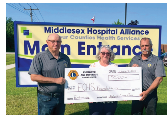
Highgate and District Lions Club $1,500