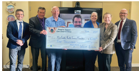
Municipality of West Elgin $5,000