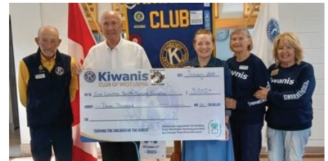
Kiwanis Club of West Lorne $3,000