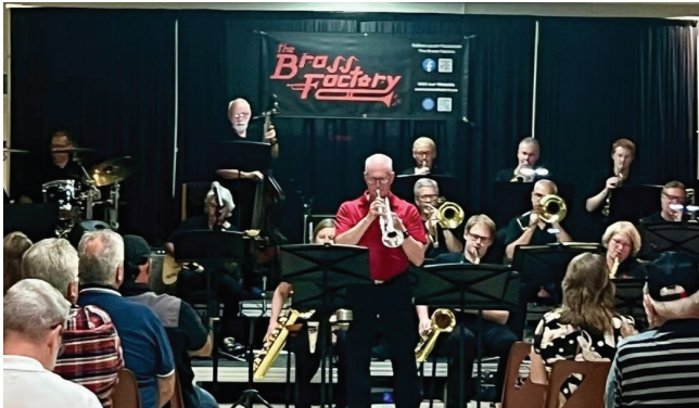
“Swing into Fall” Brass Factory Big Band Concert September 2025 - $2,095