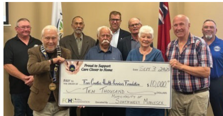
Municipality of Southwest Middlesex $10,000