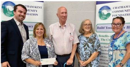
Chatham Kent Community Foundation $6,000