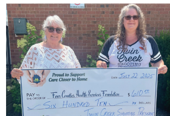
Twin Creek Shooting Preserve $610