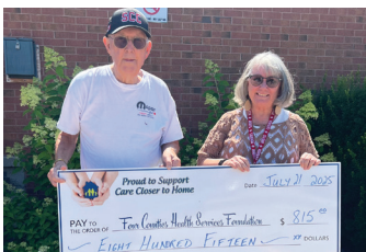
Celebrate Community Committee Car Show $815