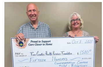
IDOE Ridgetown – Confederation Chapter $1,500