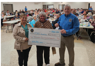
Glencoe District Lions Club 50/50 $2,795