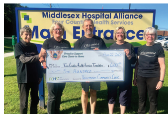
Voiceprints Community Choir $600