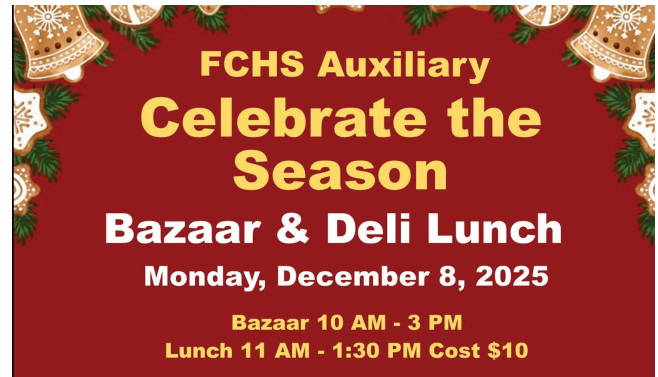
FCHS Gift Shop Sale, Bake Sale, Vendors, Raffles Contact 519-784-4274