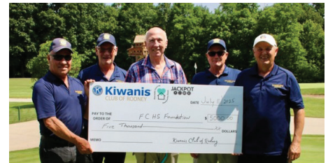
Kiwanis Club of Rodney $5,000