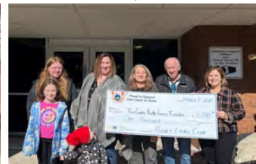
Rodney Lions Club $1,000