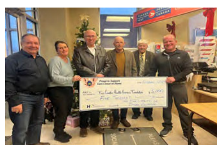
Municipality of Brooke - Alvinston $5,000