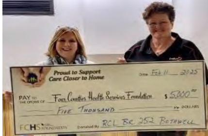
Royal Canadian Legion Bothwell BR 252 - $5,000