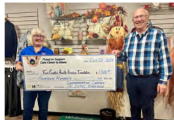
Confederation Chapter of IODE in Ridgetown - $1,300