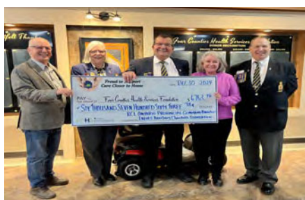
RCL Ontario Command & Ladies Aux. Charitable Foundation - $6,764