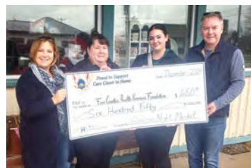
Glencoe Night Market $650