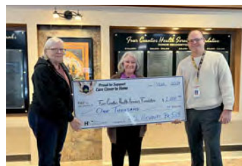
Royal Canadian Legion Newbury BR 583 - $1,000