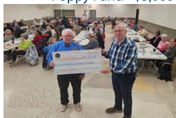
Glencoe District Lions Club 50th Ann. 50/50 - $1,915