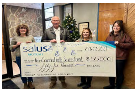
Salus Mutual Insurance Company $55,000