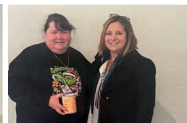
Celebrate Community Committee Cans - $147