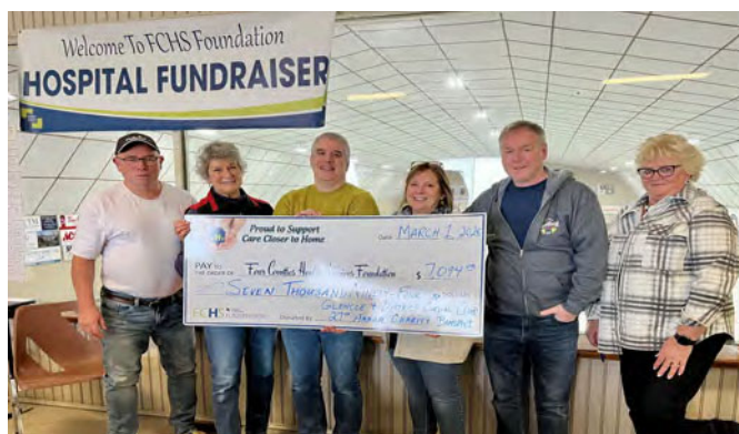
Glencoe & District Curling Club 27th Annual Bonspiel March 2025 - $7,094