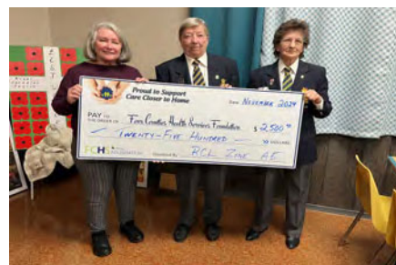
Royal Canadian Legion Zone A5 - $2,500