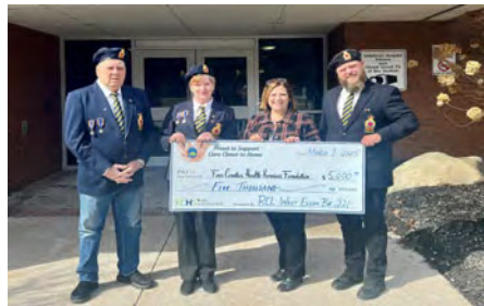
RCL West Elgin BR 221 Poppy Fund - $5,000