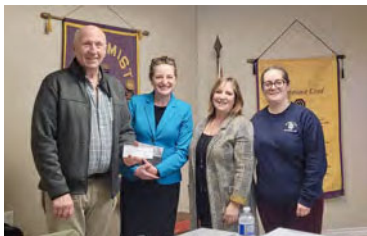
The Optimist Club of Bothwell $1,000