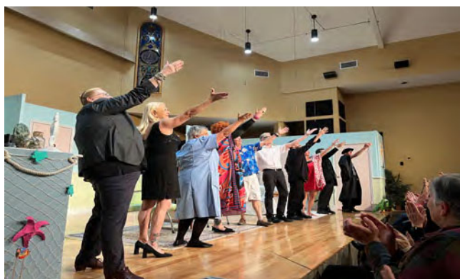
Crossroads Community Players Dinner Theatre November 2024 - $25,339