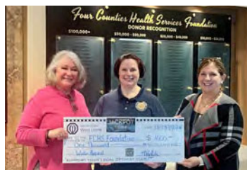
Optimist Club of West Lorne $1,000