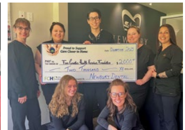
Newbury Dental - $2,000

For more information about the work of FCHS Foundation, please visit our new website at fchsfoundation.ca .