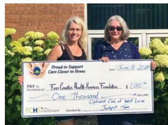
The Optimist Club of West Lorne, Jackpot Time - $1,000