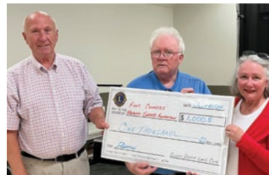
Glencoe District Lions Club - $1,000