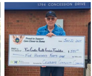
Celebrate Community Committee, Tartan Days Car Show - $541