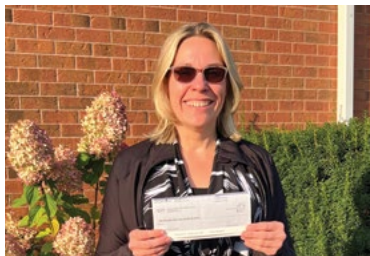
Pampered Chef Fundraiser - $433