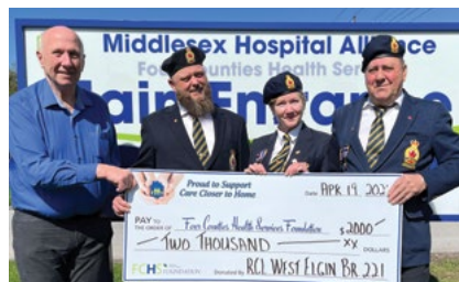
RCL West Elgin BR 221 - $2,000