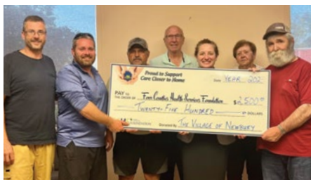
Village of Newbury - $2,500