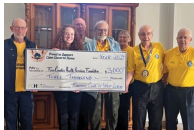
Kiwanis Club of West Lorne - $3,000