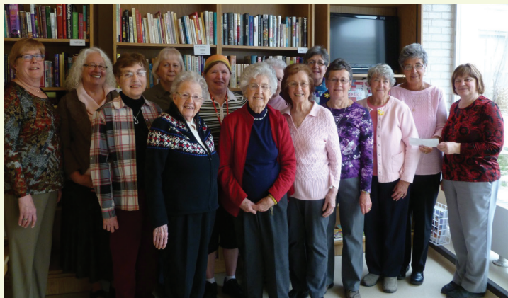
Photo is in their newly renovated Book Store