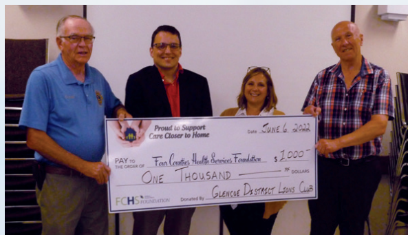
Glencoe District Lions Club - $1,000