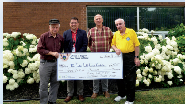
Kiwanis Club of West Lorne St Thomas Jackpot Bingo - $2,500