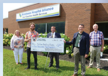
RCL Ontario Provincial Command Branches & Ladies Auxiliary Charitable Foundation - $5,200