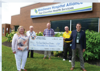
Kiwanis Club of West Lorne - $2,500