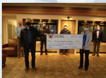
Kiwanis Club of Rodney & Members of the Kiwanis Club of Rodney - $4,500