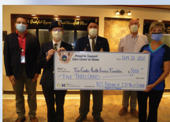
RCL Branch 221 West Elgin Poppy Fund - $5,000