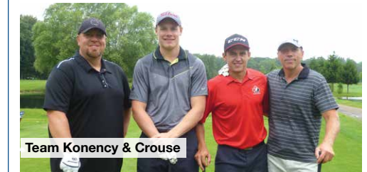
Team Konency & Crouse