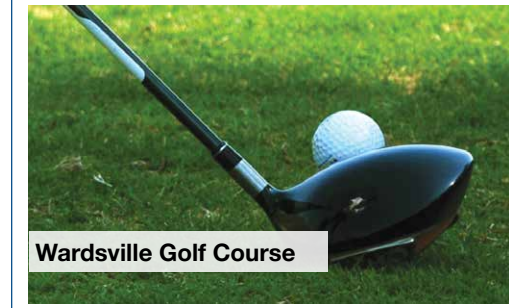
Wardville Golf Course