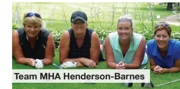
Team MHA Henderson-Barnes