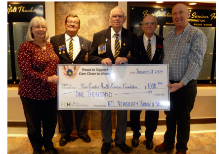
RCL Newbury Branch 583 - $1,000