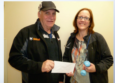
Bothwell Community Boosters - BARAC Presentation to FCHS Diabetes Program $200 for hand weights