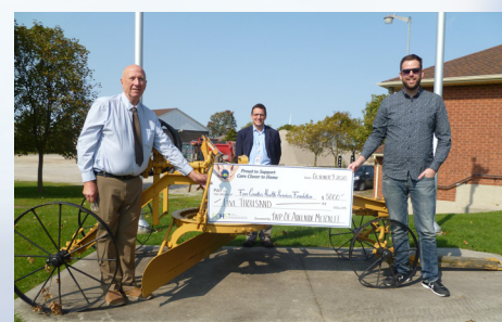
Township of Adelaide Metcalfe - $5,000 towards Ultrasound Campaign