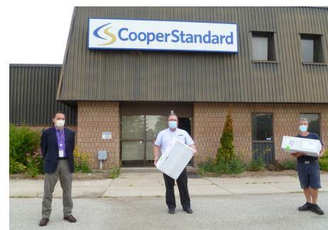
Cooper Standard Glencoe – PPE Face Shields