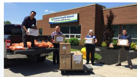
Wardsville Golf Course – PPE donation