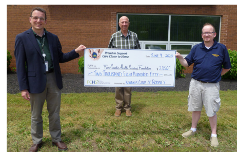
Kiwanis of Rodney – $2,850 Trivia Night Proceeds