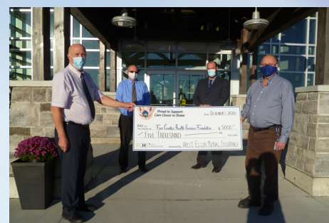
West Elgin Mutual Insurance - $5,000 towards Ultrasound Campaign