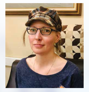
"I have been attending Four Counties Adult Day Program since February 2016. I enjoy the time I spend here interacting with everyone. I feel we are a family by choice".