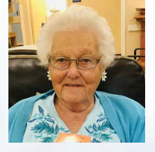
"They have a great program with lots of activities. It gets me out of the house and I look forward to coming every week".