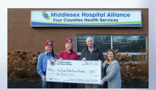
Ahcom Shrine Club, Chatham - $1,000