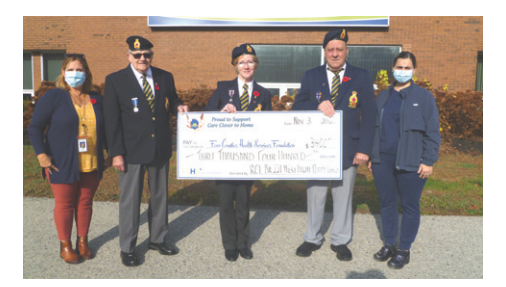
RCL West Elgin Br. 221 Poppy Fund $3,400