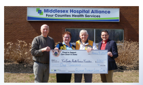
Glencoe District Lions Club - $1,000