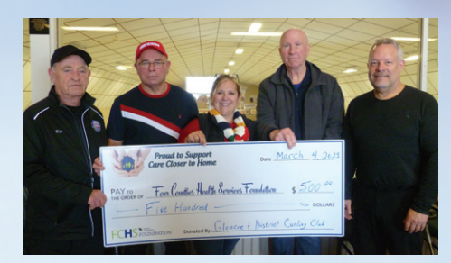
Glencoe & District Curling Club Bonspiel $850 (total)